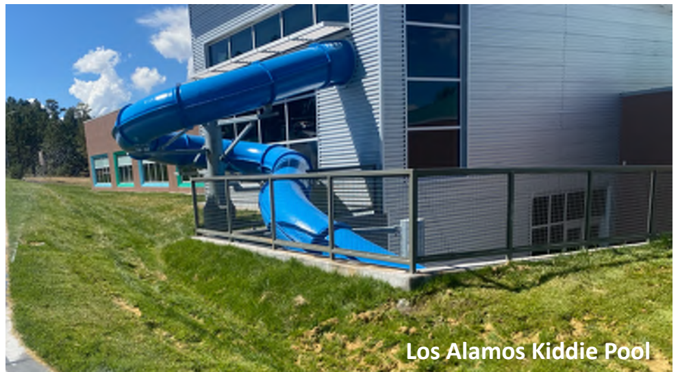
Los Alamos Kiddie Pool